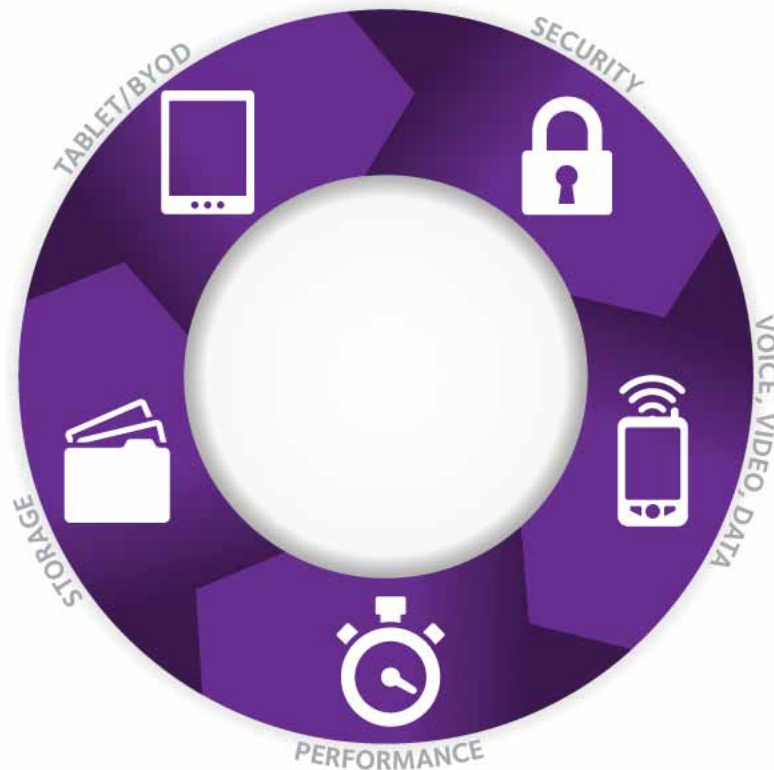
Figure 3: The Impact of Mobile Learning on the IT Ecosystem

According to IDC, digital content is expected to double in size every 18 months. 18 The storage needs of educational institutions will grow exponentially due to the unprecedented levels of data production and consumption enabled by mobile devices. In digital-based learning environments, students and teachers will eschew paper materials to save and access core content such as homework, lesson plans, and tests from mobile devices. As students go from kindergarten to 12th grade in schools or from freshmen to seniors at universities, profiles are created for each of them based on their cumulative body of work.